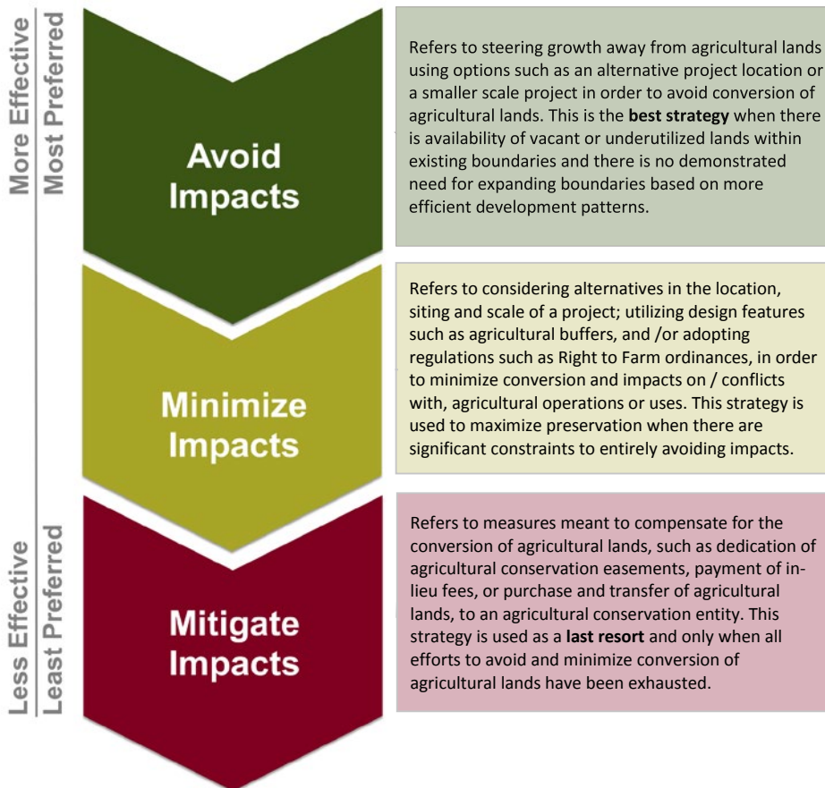
Figure 3. Hierarchy for Agricultural Land Preservation Strategies

LAFCo’s unique mandates to preserve prime agricultural lands and discourage urban sprawl, and the fact that agricultural lands are a finite and irreplaceable resource, make it essential to avoid adversely impacting agricultural lands in the first place.